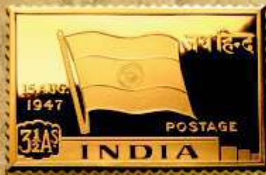
A sculpted ingot and its inspiration. Each ingot is a faithful representation of the original stamp.

The Pride of India Collection is the first and most important stamp ingot collection ever produced for India. It is a treasured heirloom to be passed from one generation to another.