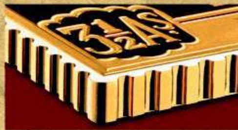
Each stamp ingot is 2.2mm thick, with diamond cut perforations.